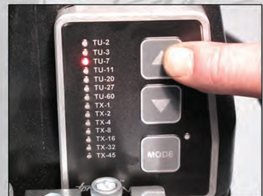
Push button tool selection for Torcup TU and TX Wrenches